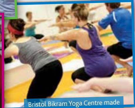
Bristol Bikram Yoga Centre made us their charity of the month for May and donated proceeds from their Friday night class.