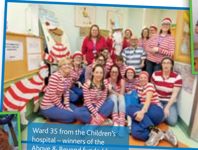
Ward 35 from the Children's hospital - winners of the Above & Beyond funded fancy dress competition.