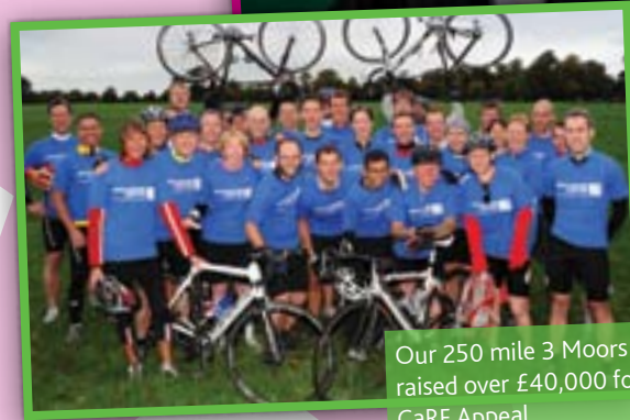
Our 250 mile 3 Moors Tour raised over £40,000 for the CaRE Appeal.